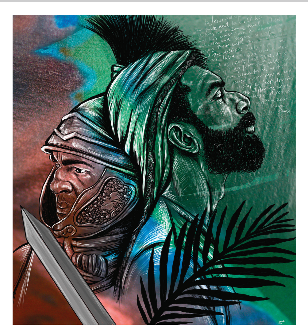
Cover by Sanctified Art: "Power Play" by Lisle Gwynn Garrity, inspired by Matthew 21:1-11

Sending well-equipped disciples of Jesus into the world—compassionate, generous, resilient, and wise