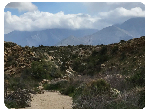
Anza-Borrego State Park